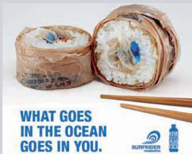
Figure 10. Plastic sushi ad